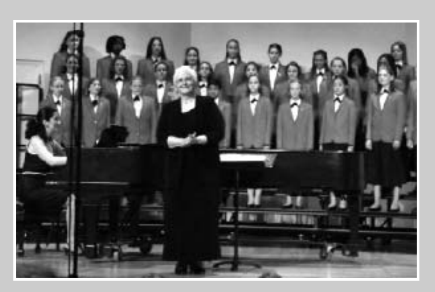
The Columbus Children's Choir

K.I.S.S. – Keep It Simple, Stupid. Make sure you can sing well and have choreography that you can do well and doesn't get in the way of your singing! Then worry about the props and 47 costume changes. Concern yourself with doing the basics well and other stuff will come. Strive for the philosophy: "we are a choir that dances," not dancers that sing.